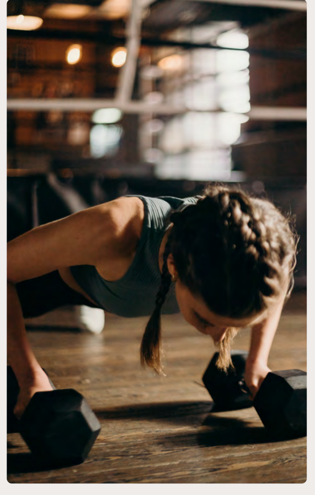
Page 7 - Los Gatos Swim & Racquet Club