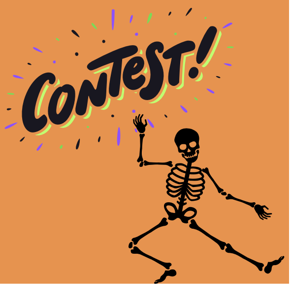
Page 4 - Los Gatos Swim & Racquet Club

Good luck and we can't wait to see you all in your costumes!!!